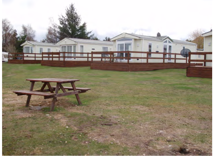
Fig. 3 - Static caravans on application site