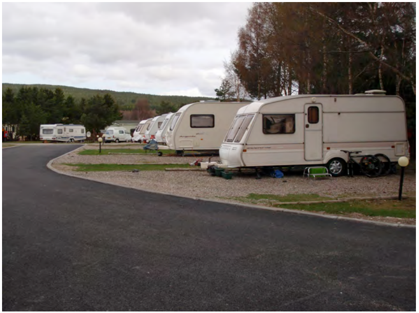
Fig. 4 - Towable caravans on application site